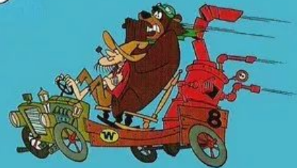
"THE ARKANSAS CHUGGA-BUG"