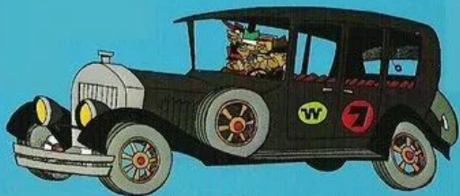
"THE ROARING PLENTY"