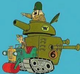
"THE ARMY SURPLUS SPECIAL"