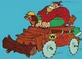
"THE BUZZ WAGON"