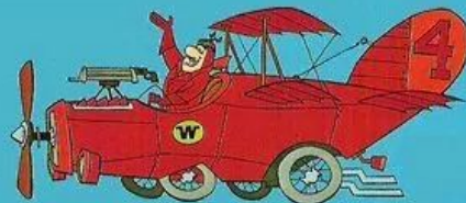
"THE CRIMSON HAYBALER"