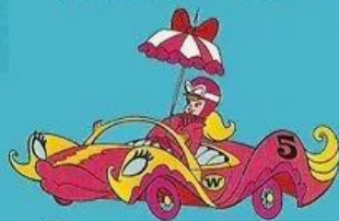
"THE COMPACT PUSSYCAT"