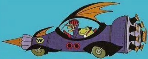
"THE MEAN MACHINE"