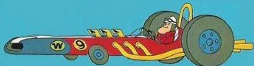
"THE VAROOM ROADSTER"