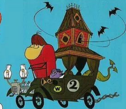
"THE CREEPY COUPE"