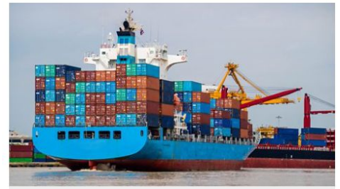
Container ships are used to transport trade goods all around the world.

Click the link to find out about this topic and complete the activities.