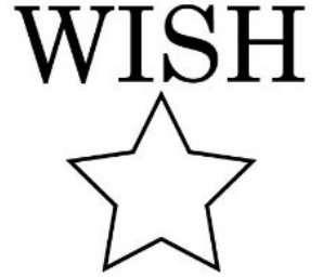
Wish upon a star